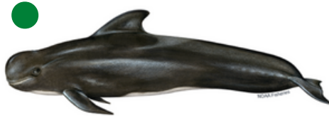
Short-Finned Pilot Whale ( Globicephala macrorhynchus )